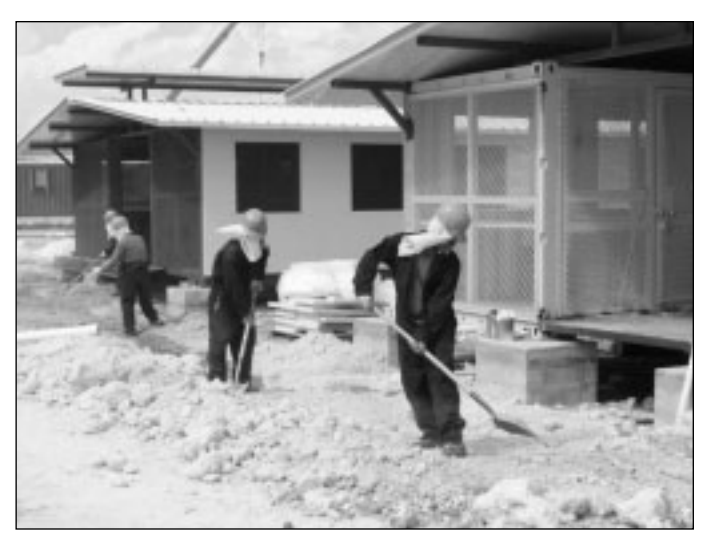
Camp Delta, Guantanamo Bay, Cuba.

Halliburton officials say they immediately told the Pentagon about the problem. "Halliburton internal auditors found the irregularity, which is a violation of our company's philosophy, policy, and our code of ethics," a Halliburton spokeswoman said. "We found it quickly, and we immediately reported it to the inspector general. We do not tolerate this kind of behavior by anyone at any level in any Halliburton company." Around the same time, a new problem surfaced: A previously undisclosed memo from a branch office of the Defense Contract Audit Agency labeled as "inadequate" Halliburton's system for accurately estimating the cost of ongoing work. The memo was sent to various Army contracting officials, and Pentagon officials said they subsequently rejected two huge proposed bills from Halliburton—including one for $2.7 billion because of myriad "deficiencies." 23In a briefing to Congress last February, GAO officials described a lack of sufficient government oversight of the Halliburton contract. Some of the monitoring was conducted by military reservists with only two weeks' training, and one $587-million contract had been approved in 10 minutes based on only six pages of documentation. In another case, the GAO reported that Halliburton was